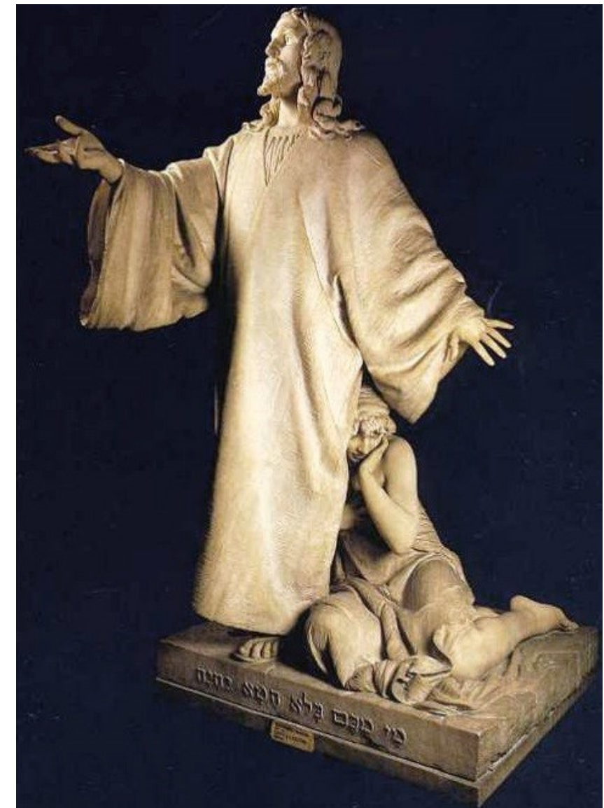
Christ and the adulterous woman (Cristo e a mulher adúltera)

Rodolpho Bernardelli (1881, Museu Nacional de Belas Artes)