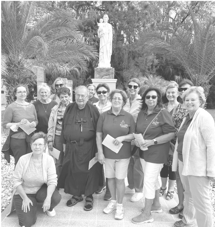
The ladies from our St. Mary Women's Club half day of reflection

Fridays of Lent 4 p.m. in the main church