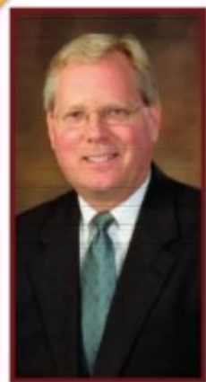
Frank Benischeck Morning Show Guest On...

Rodolpho Bernardelli (1881, Museu Nacional de Belas Artes)